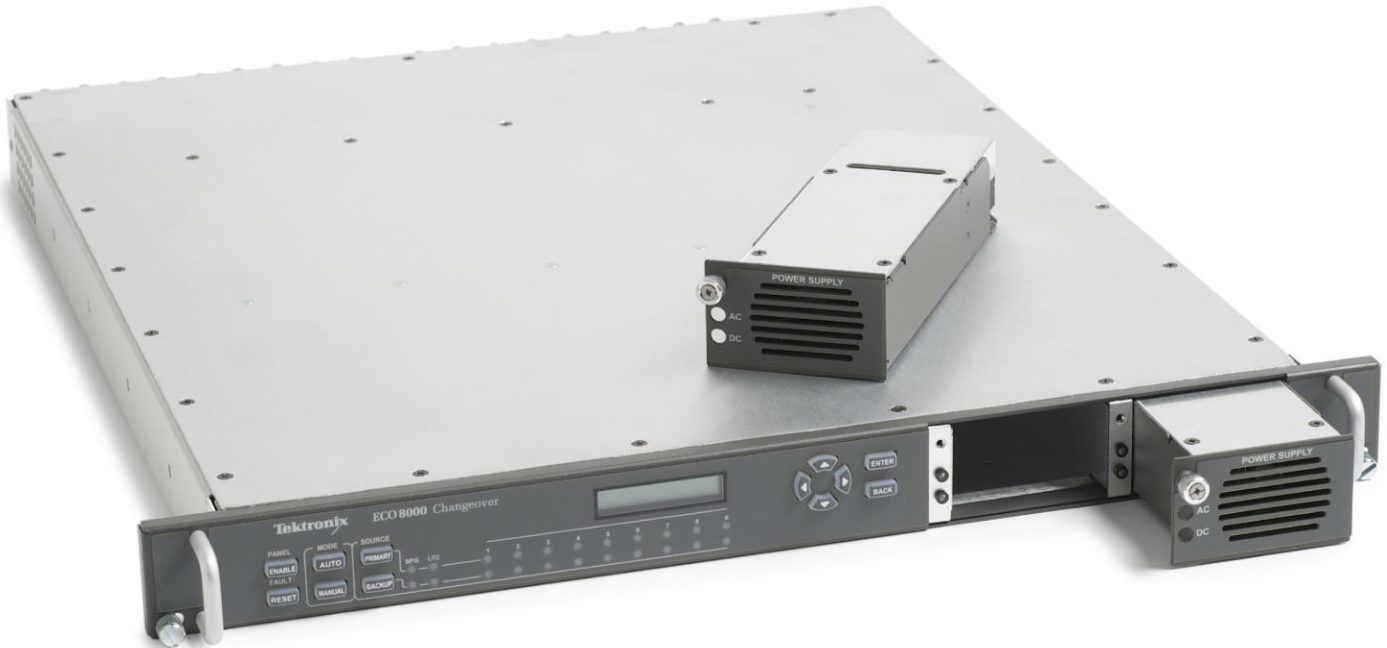
Option DPW backup power supply